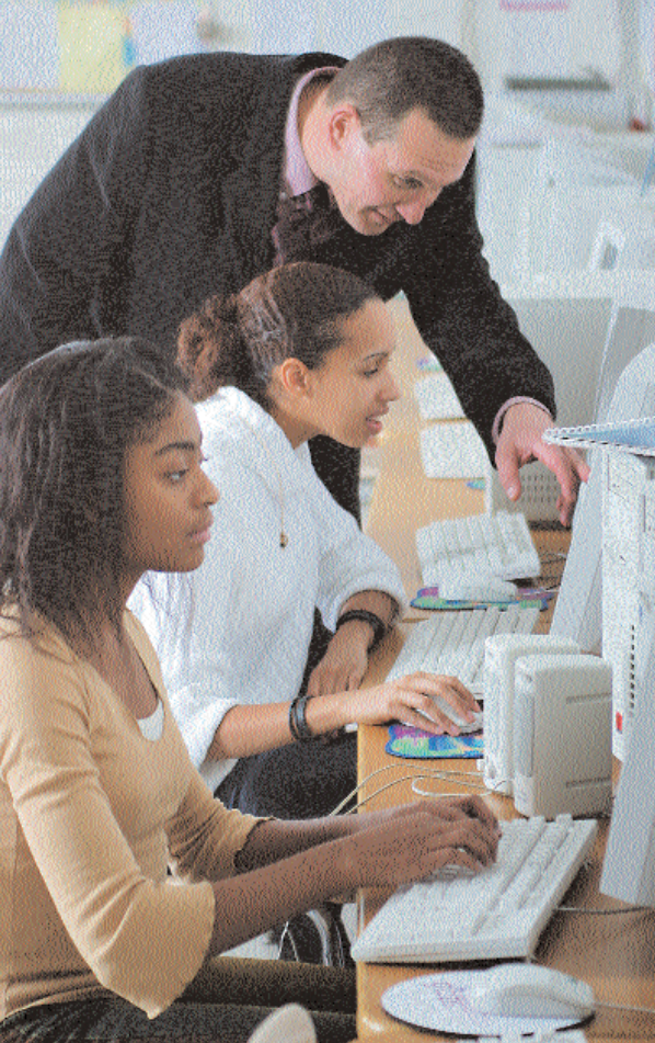
A J&W student teacher points out the latest technological advances to North Providence High School students.