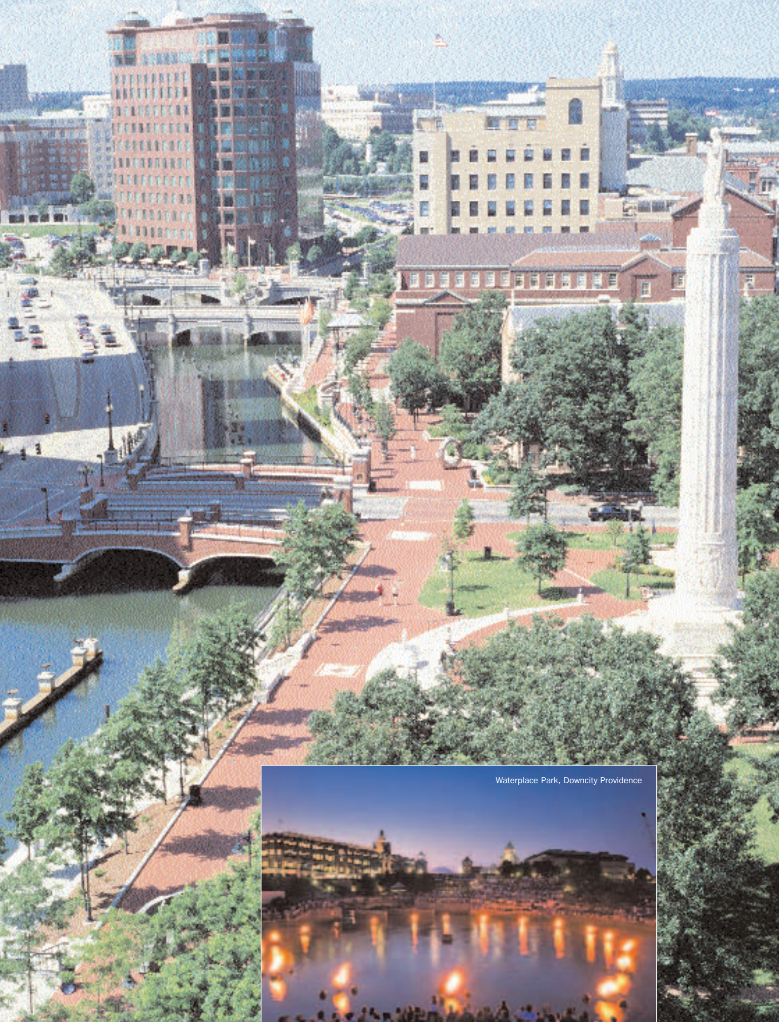
Waterplace Park, Downcity Providence