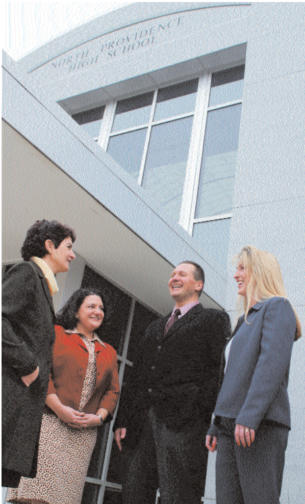
A North Providence High School teacher and J&W student teachers meet with a J&W School of Education professor.