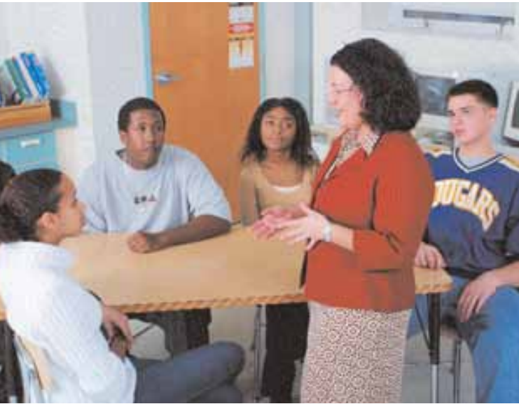
A J&W School of Education student teacher lectures North Providence High School students.