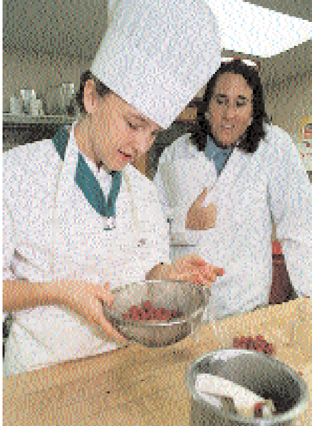
A high school culinary student learns in a J&W culinary lab.