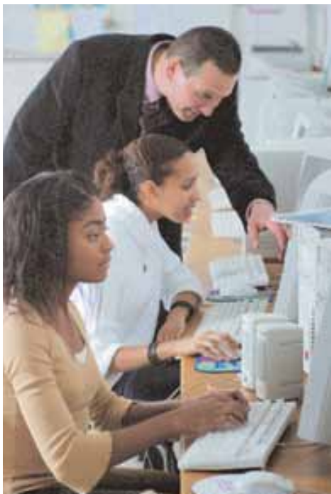
A J&W student teacher points out the latest technological advances to North Providence High School students.