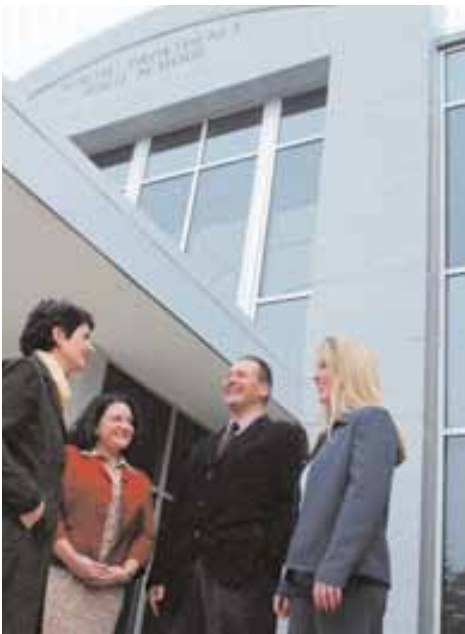
A North Providence High School teacher and J&W student teachers meet with a J&W School of Education professor.

To foster this communication, the University has sponsored regularly scheduled conferences for the professional development of cooperating teachers. High school teachers are continuously invited to address University classes and prospective teachers, while University professors are available as instructional and research resources within the public schools. This communication impacts the development of University professors' course syllabi and provides prospective teachers with the knowledge necessary to succeed in teaching high school students.