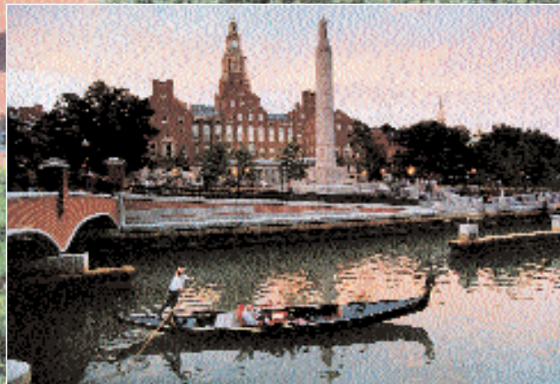
Waterplace Park, Downcity Providence